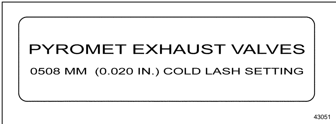
Figure 1. .020" Cold Lash Setting Label P/N 23530710